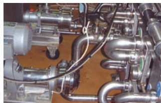
S4C FOR CONDITIONING