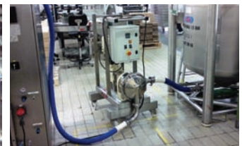
S4C FOR TRANSFERRING