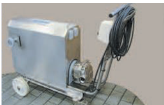
S4C ON MOBILE UNIT