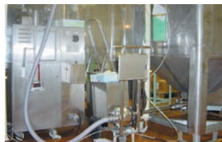
S4C WITH FLEXIBLE HOSE